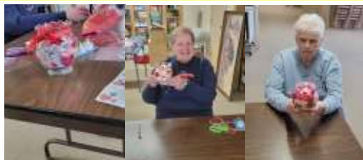
GAL'S DAY PICTURES!